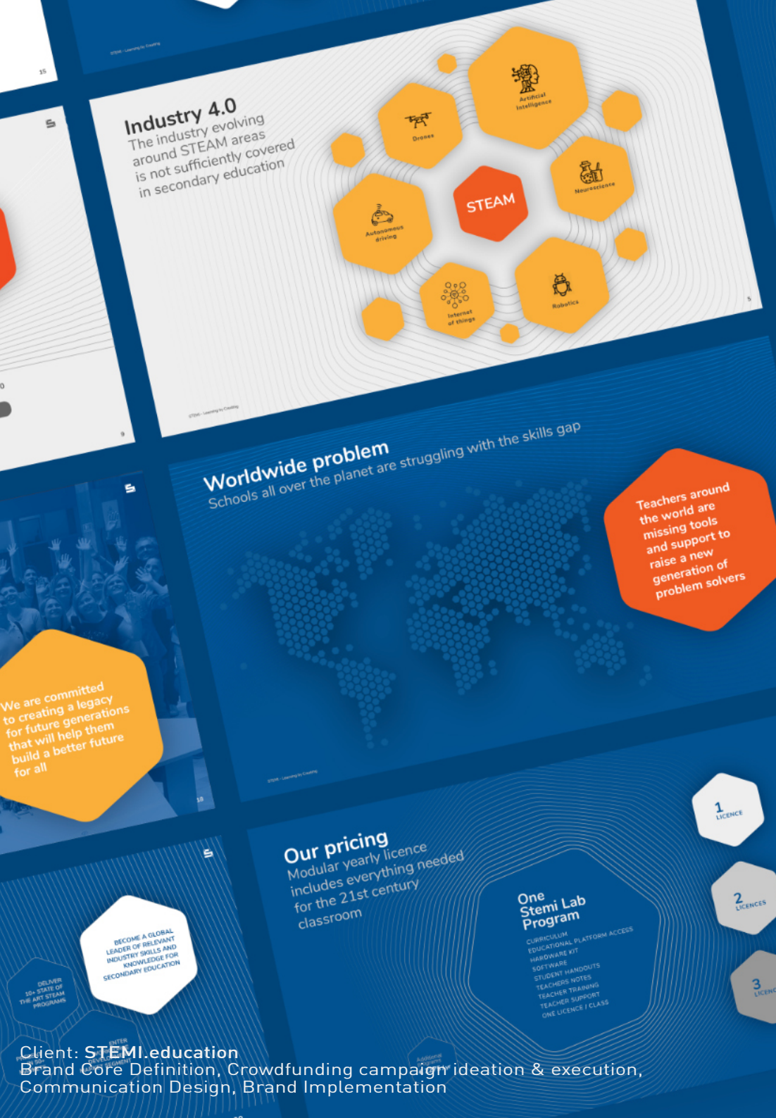
Client: STEMI.education Brand Core Definition, Crowdfunding campaign ideation & execution, Communication Design, Brand Implementation