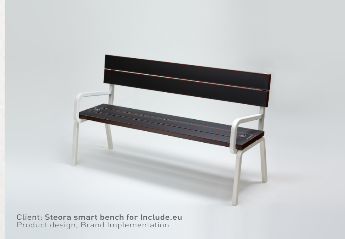
Client: Steora smart bench for Include.eu Product design, Brand Implementation