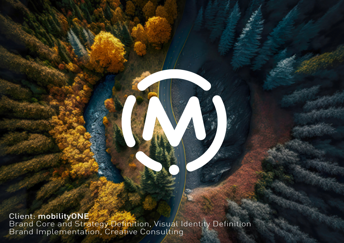
Client: mobilityONE Brand Core and Strategy Definition, Visual Identity Definition Brand Implementation, Creative Consulting