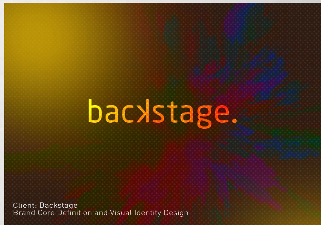
Client: Backstage Brand Core Definition and Visual Identity Design

Our approach to Visual Identity crafting extends far beyond design of unique logotypes and visuals. We're storytellers who sculpt all elements of visual identities, creating narratives that resonate deeply with your audience. Our designs not only captivate but also ensure consistency and memorability, forging emotional connections that endure.