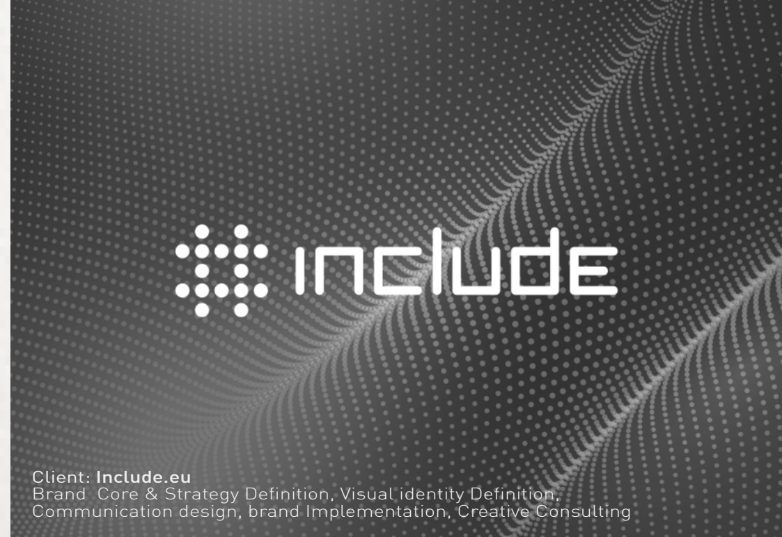
Client: Include.eu Brand Core & Strategy Definition, Visual identity Definition, Communication design, brand Implementation, Creative Consulting